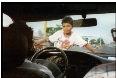
Young boy in Managua trying to make some money, most likely, to assist with supporting his family.