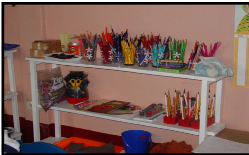
School supplies in use at the Maria Montessori School in Masaya. More supplies are needed for this and other schools in Nicaragua.