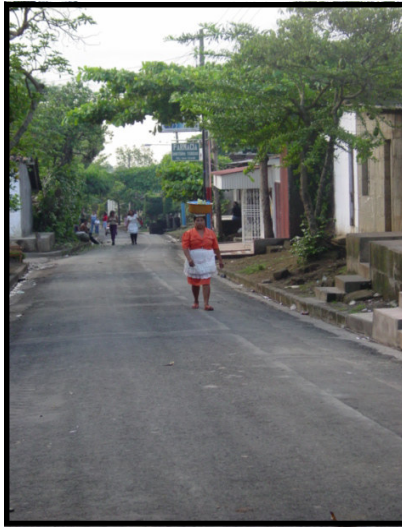
A lady from Mastatepe on her way to sell homemade Candy, Juices, Fruits, etc. on the streets or onboard busses (the predominant mode of public transportation).

This year's journey to NI went very smooth as compared with last year's challenges. Thanks to all who assisted in making this trip productive and rewarding.