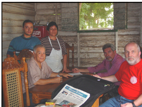
The administrator of an Old Peoples Home in Masaya, Carazo receiving useful items and funds. One resident, shown to the right, once worked in Chicago, therefore, the Chicago Tribune and a large box of Franco Mints to be sampled by all residents at the home.