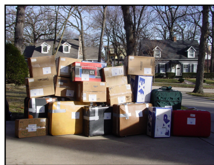
January 2003 shipment ready to go...