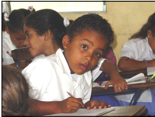
Young mind at work at the Nehemias School , Sta Teresa, Carazo

Again, without the goodwill of so many Individuals and Businesses, this would not be doable.