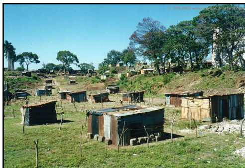
A place to call home seen all over Nicaragua.