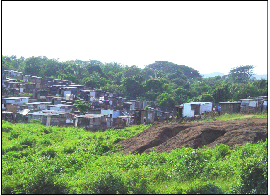
Squatter settlement close to the capital city, Managua. Five days prior to this photo, the land was vacant.

9 of 24 Volcano’s in Nicaragua are presently active.