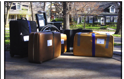
6 November 2004 - Ready for departure...

CONTINENTAL AIRLINES, ORD, CHICAGO ITASCA BANK AND TRUST CO., ITASCA RAGAS & SPERLAZZO. D.D.S., ITASCA PESCATORE PALACE, FRANKLIN PARK SCHWEPPE SUPPLY COMPANY, LOMBARD SEMINOLE PLAZA HOTEL, MANAGUA, NI TCSA - TRITON COLLEGE, River Grove