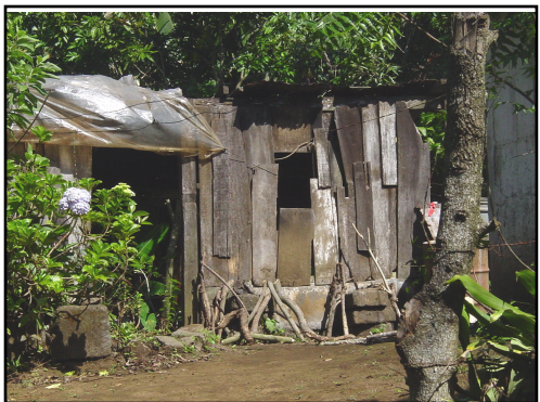
Below: Student home near the entrance to the school.

This being the 10th trip in 8 years allows me to reflect a bit on the activities since the beginning in 1996. This years journey was very productive with regard to accomplishments. Items and funds valued at $7,581.00 were distributed to needy entities and some individuals. Having had an association with a university in San Marcos, Carazo for years, I continue to use the campus as a base. An example on how bad things are in Nicaragua at present, I gave each employee, in the cafeteria $10.00 towards the end of the visit. Almost all of them went out, right away, to purchase beans for their family in order to prepare the national dish, Gallo Pinto consisting of beans, rice and onions.