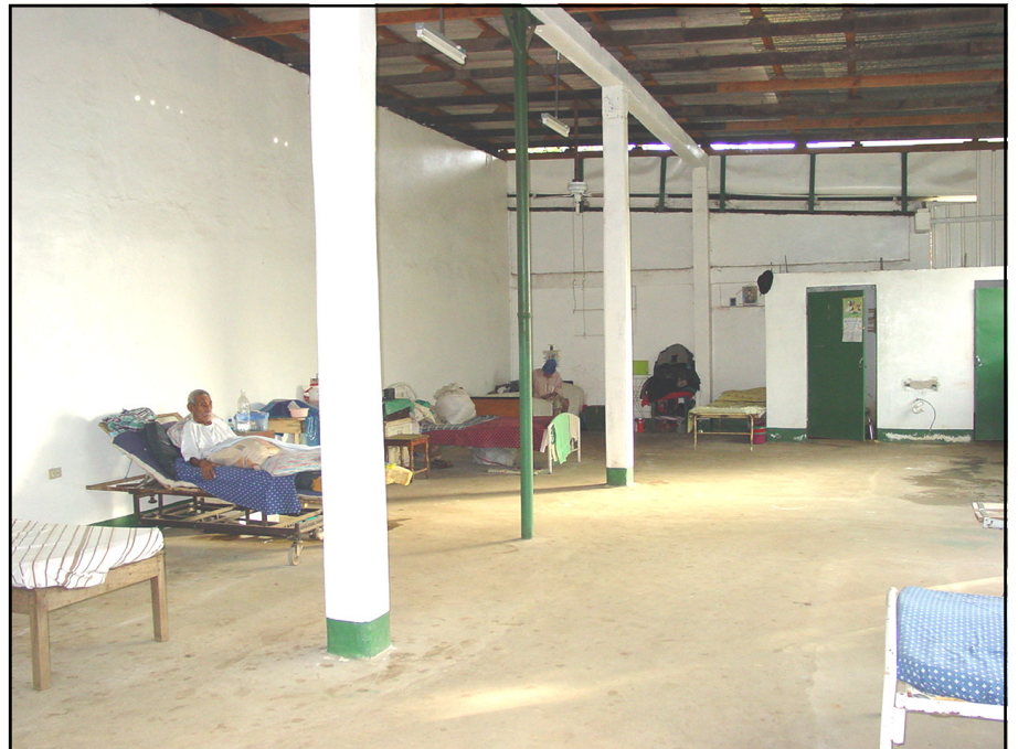
Sleeping quarters At Hogar de Ancianos Castro Flores (Old peoples home, Masaya, Carazo) Wheelchairs and Walkers are urgently needed along with any kind of medical supplies.

“I hope, you will see this as an opportunity to assist. Together, we can make a change in somebody’s life.”