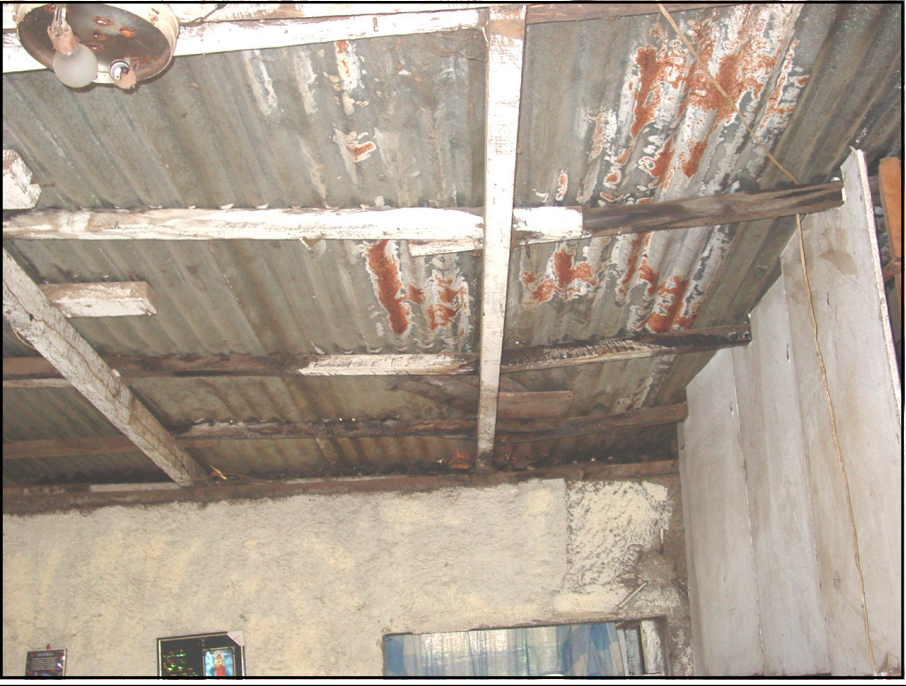
Leaky Roof situation in a living room in San Marcos, Carazo, one of thousands throughout Nicaragua.

2006 Assistance-Items and Funds: $6,300.00. Since 1996: $50,300.00+