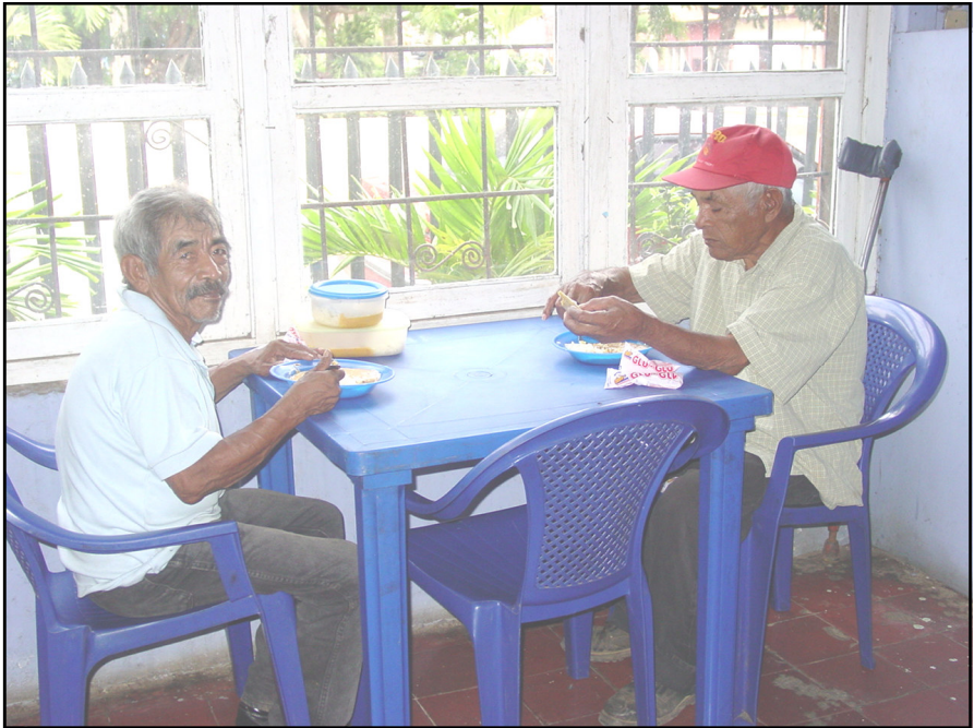
One Meal a day at Noon being served at the "Comedor de la 3a Edad La Purisima", Diriamba, Carazo to about 70 Seniors.

Items Needed List... Posted at: Hogar de Ancianos Y Albergue de Protección, San Marcos, Carazo