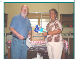
Food items being delivered to Hogar de Ancianos Horizonte, San Marcos, Carazo on May 29, 2007.

...If I, inadvertently, omitted somebody from the list, please accept my apology.