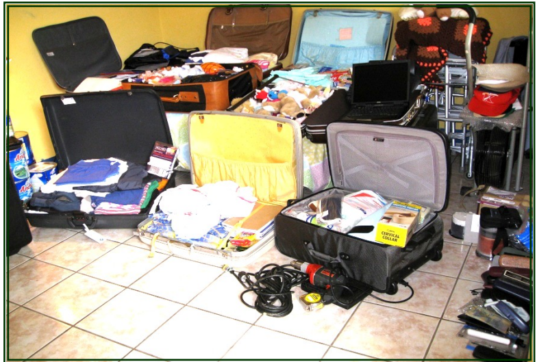
The content from 14 pieces of luggage seen here prior to being distributed. We are in constant need of Medical and School Supplies. Please see listing of items needed to the left. Thank you.