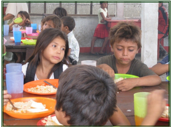
Volunteers feeding the children of La Chureca one meal a day.