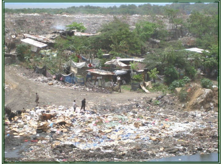
View of La Chureca – “The Dump” in Managua.

An infant boy and a young girl had just recently been dropped off by their mother because she could not afford to take care of them. They are now being attended to by older children or perhaps an adult. Whole generations have lived this way.