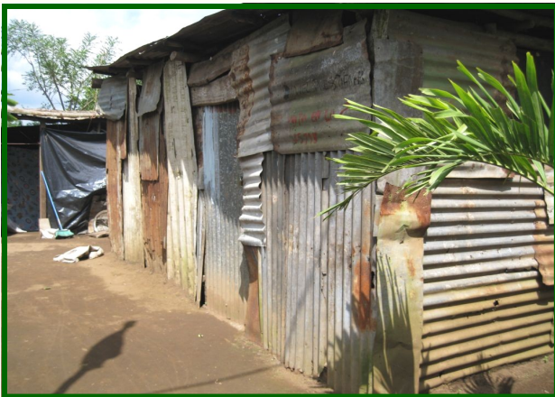
San Antonio Pre-School Building