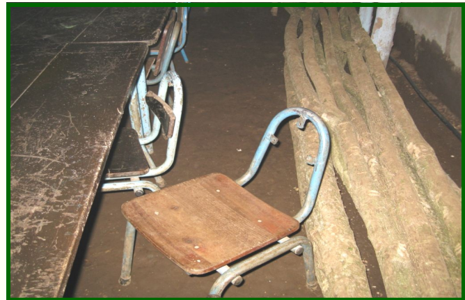
San Antonio Pre-School Classroom