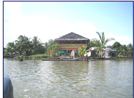
CASA ULRICH — Laguna de Perlas