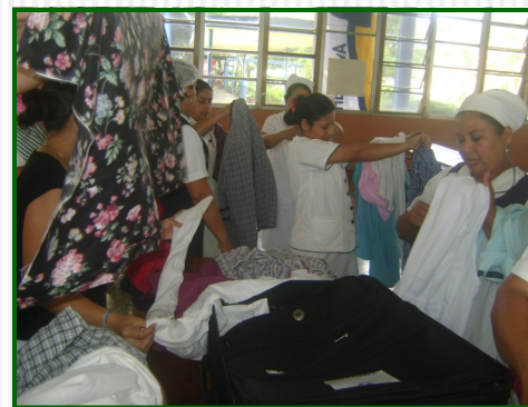
Cafeteria Staff picking clothing items.

*Period from June 5, 2009 through November 8, 2010.