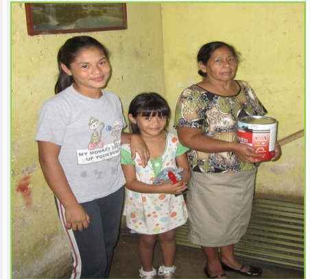
Roofing Material delivered to family in San Marcos

*Period from November 9, 2010 through November 8, 2011.