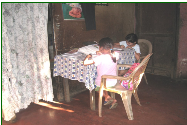
School-work time in San Marcos - Replaced Metal Roofing Sheets on this home

2011 marked the 16th Humanitarian Journey to Nicaragua. During 2011 we were able to ship several parcels to Nicaragua via Wisconsin/Nicaragua Partners, http://www.wisnic.org . Please visit their Web-Site and you will be impressed, like we are, by this non-for-profit organization's work in Nicaragua for over 40+ years. We are grateful for their cooperation and like to be supportive whenever we can.