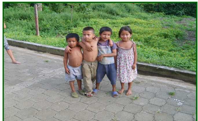
Children from San Antonio - Dolores