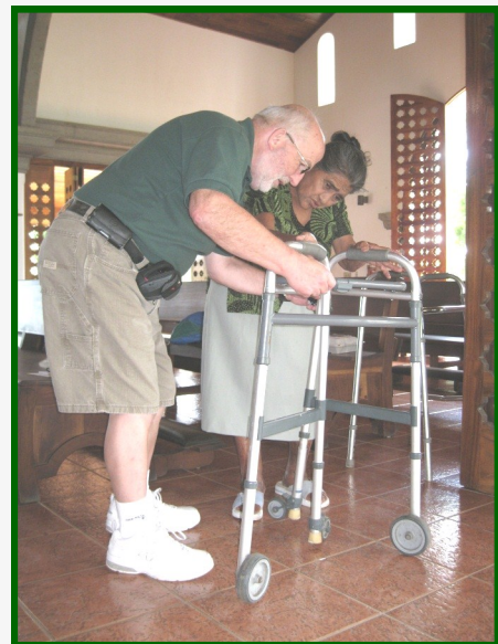
A Walker being provided to an elderly lady in San Marcos, Carazo.