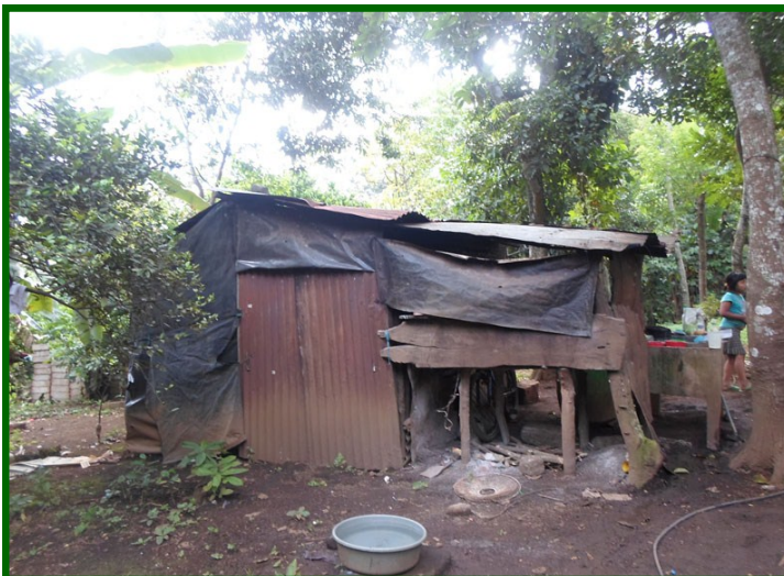
A project presently being evaluated. Two adults and two children are living here.

In the past year we have shipped or brought with us items i.e. Clothing Material, School Books and Supplies, Blankets, Medical tape, Hygiene Items, Eye Glasses, Plumbing Supplies, Wheel Chairs, Walkers, Crutches, Laptop Computers, Software, PC-Parts, Router with Table, and Hand Tools.