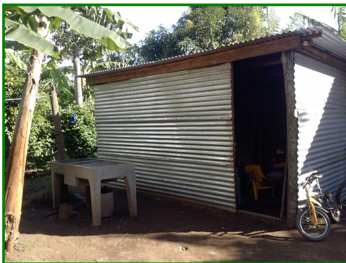
New siding on family home in San Marcos, Carazo. One of several projects on this journey. Please read the comments above, thank you.