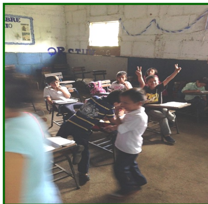
Students at the Ima Kindergarten/ Elementary School, a converted Horse barn in need of much attention ....