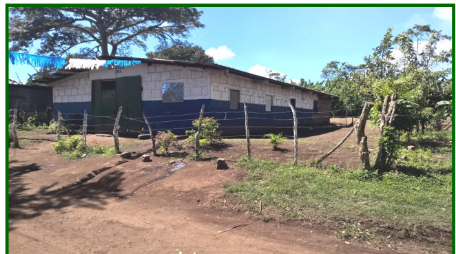
A newly acquired structure, an old Horse barn which now functions as a school building serving Kindergarten through 6th grade. Kindergarten and 1st. Grade Classes are combined and likewise, 3rd and 4th. Nicaragua-Direct is assisting with educational supplies to both Students and Teachers....