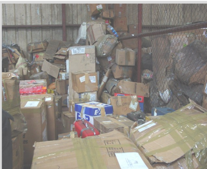
Shipment arrived in Managua in 2002. After two days only salvaged a few items before giving up. Learnt a great deal from that experience.