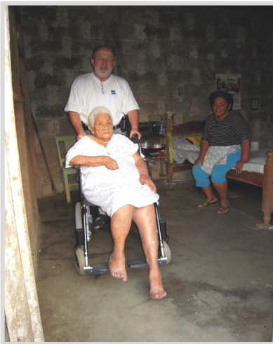
One of many wheel-chairs delivered to a needy person. This Lady in Jinotepe, Carazo was waiting for several years. Still being used today.