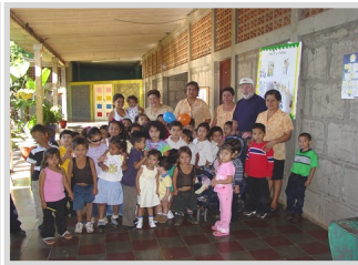
CDI Samual Calero-Kindergarten School-San Marcos, Carazo.

On every journey something out of the blue happens. This year after purchasing school supplies in the capital, Managua our truck broke down on the way back to San Marcos. A ball-joint broke and luckily it did not happen going 100 km/hour.