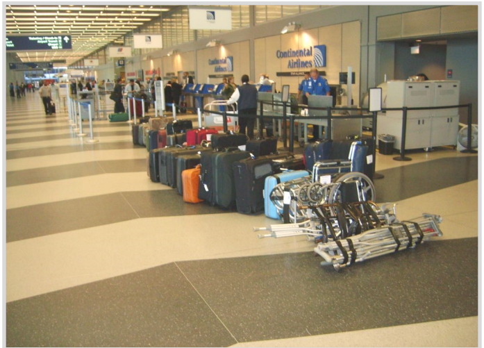
Those were the days .....,when Humanitarian work gave you a break with the airlines. Things have changed. The picture is from the departure at ORD-O'Hare International Airport, Chicago, IL in 2010 .

On every journey something out of the blue happens. This year after purchasing school supplies in the capital, Managua our truck broke down on the way back to San Marcos. A ball-joint broke and luckily it did not happen going 100 km/hour.